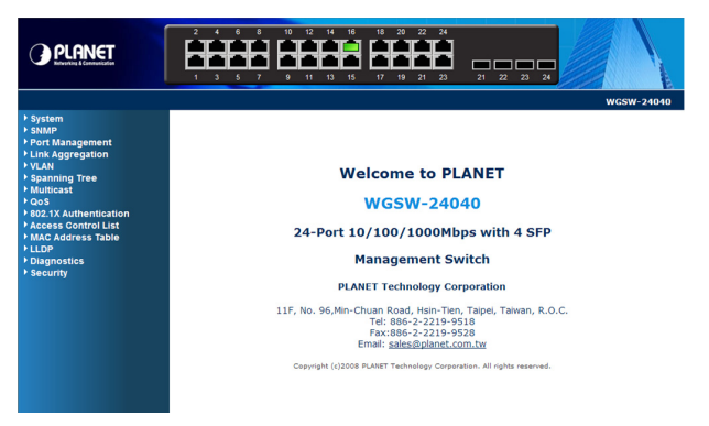
Figure 6-3 Web Main Screen of WGSW / SGSW Managed Switch

The following screen based on WGSW-24040 for SGSW-24040 the display will be the same for WGSW-24040.